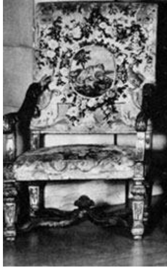
Figure 3: Louis XIV chair.

So the whole caption for your image might look like this: