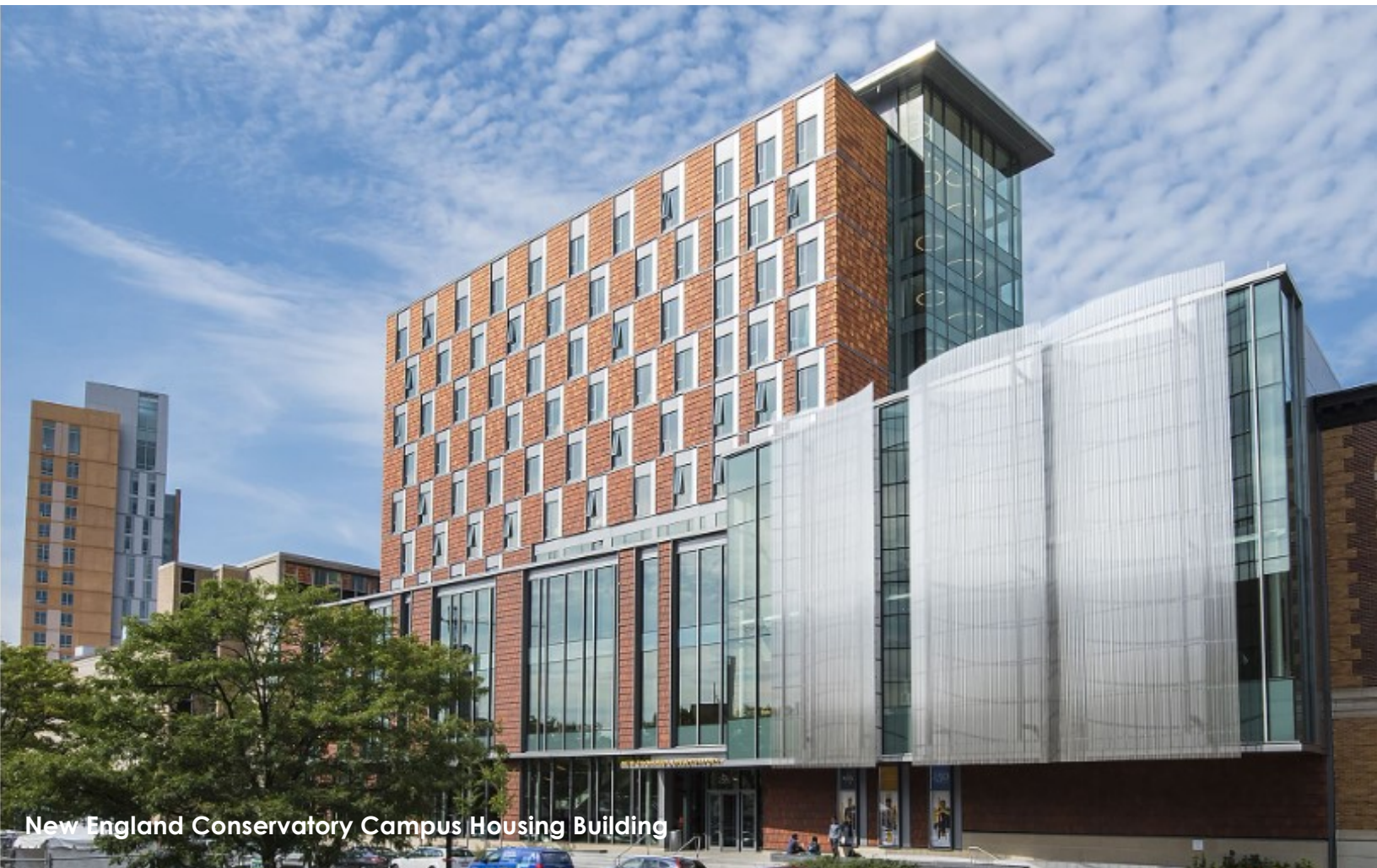
New England Conservatory Campus Housing Building

If you'd like to learn more, reach out to the BAC Office of Student Life.