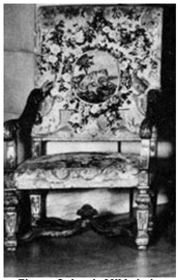
Figure 3: Louis XIV chair.

So the whole caption for your image might look like this: